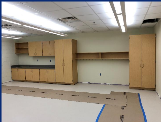
Casework in Area F