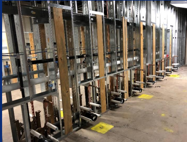
In Wall Blocking in Area G Restrooms