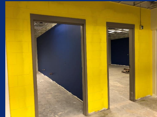
Accent Walls in Area K Corridor