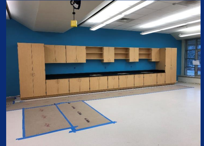
Stem Lab Casework in Area F