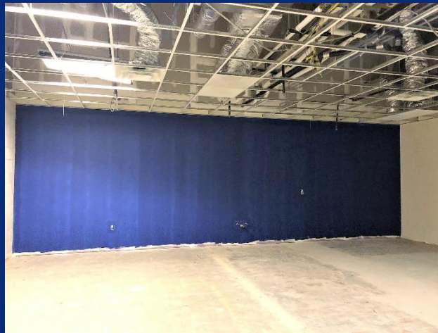
Accent Wall in Area K Classroom