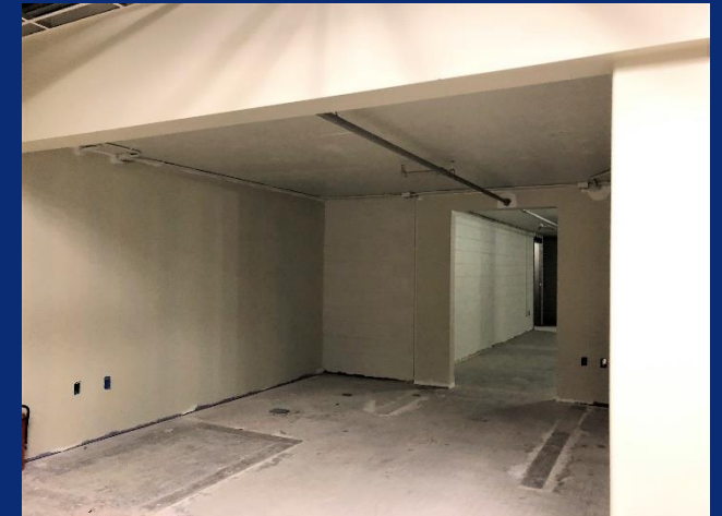
1 st Coat of Paint in Area K Corridor